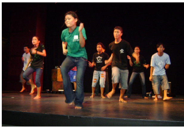
The energetic cast from 'Pangarap ng mga Batang Kalye'

quently brought those dreams crashing down around them.