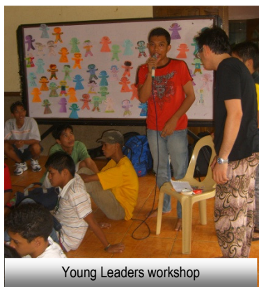
Young Leaders workshop

Bahay Tuluyan is looking for donations for showbags which will be given to the children attending the festival. If you are able to assist, please contact us.