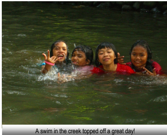
A swim in the creek topped off a great day!

Attended by more than 100 children and adults, the day was a combination of games, presentations and competitions. Lots of laughing, singing and dancing made us, young and old, remember the importance of being kids.