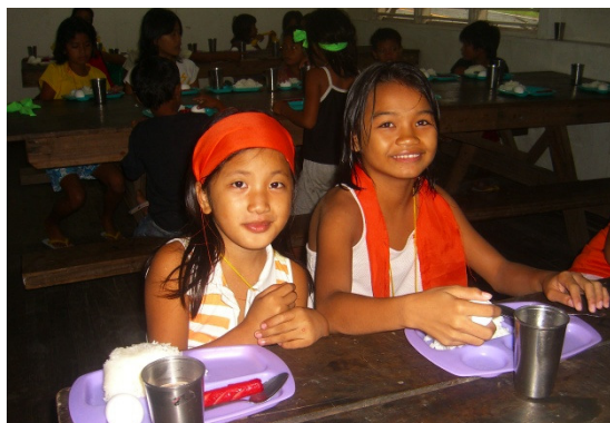
Two street children eating breakfast at a camp sponsored by ASMAE

The staff and children will be sad to see her leave in December 2008 but look forward to a continuing and fruitful partnership with ASMAE..