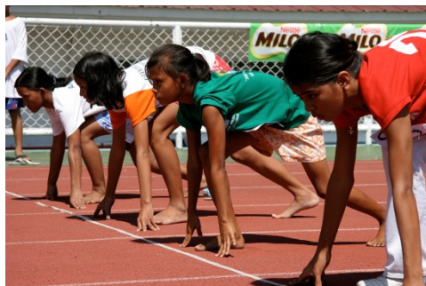
Ready, set, go! Enthusiastic participation in the Summer Olympics