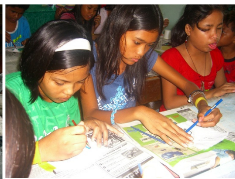
Children sharing their messages and dreams during the annual General Assembly of Bahay Tuluyan