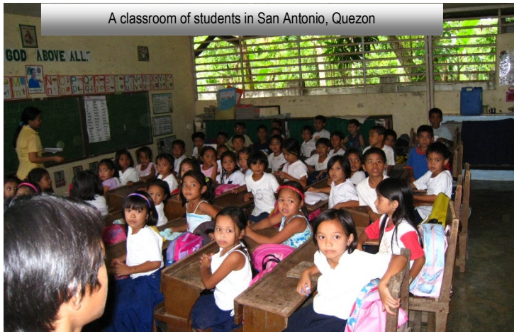
A classroom of students in San Antonio, Quezon

Once a month all of those children who have attended class without any unauthorised absences are invited to a special celebration. This recognition, dubbed the 'perfect club' by the children, has proved to be a powerful incentive against the temptation of cutting class. In 2007 the numbers of children achieving 'perfect attendance' quadrupled in the first four months of implementation of the 'perfect club'. We hope for even better results this year!