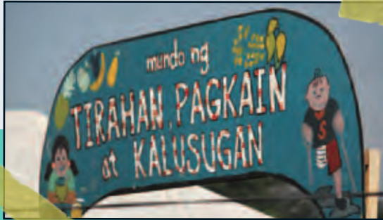
The entrance to the Health Nutrition and Welfare World at the festival